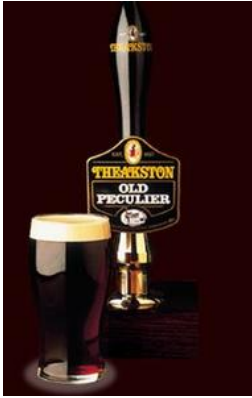
Brewery Visitor Centre

Ripon, HG4 4YD, North Yorkshire, England