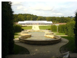
Alnwick Garden - the inspiration of the Duchess of Northumberland

Alnwick, NE66 1YU, Northumberland, England