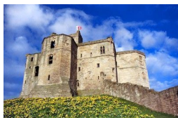
One of the most impressive fortresses in northern England, dating back to the 12th century.

Warkworth, NE65 0UJ, Northumberland, England