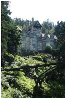
Former home of Lord Armstrong. The first house in the world to be lit by electricity.

Historic Buildings and Monuments, Parks Gardens and Woodlands, Visitor Centres and Museums, Cafes Coffee Shops and Tearooms