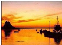
Romantic 16th-century castle with spectacular views, transformed by Lutyens into an Edwardian holiday home

Beaches, Historic Buildings and Monuments, Parks Gardens and Woodlands, Cycling and Mountain Bikes, Walking and Climbing