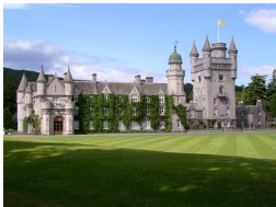
5 Star visitor attraction set amongst the magnificent scenery of Royal Deeside

Historic Buildings and Monuments, Parks Gardens and Woodlands, Visitor Centres and Museums