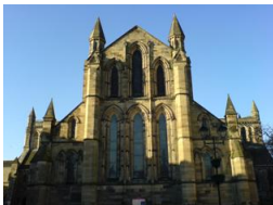
Attractive market town and its Abbey dating from AD674

Historic Buildings and Monuments, Parks Gardens and Woodlands, Visitor Centres and Museums, Bistros and Brasseries, Cafes Coffee Shops and Tearooms, Pubs and Bars, Restaurants, Shops