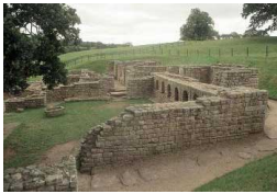
Remains of a fort built to guard the Roman bridge over the River Tyne

Historic Buildings and Monuments, Visitor Centres and Museums