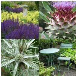
Chesters Walled Garden is a 2-acre 18th Century garden, surrounded on three sides by sheltering woods of beech and yew, and open to the south with views over the lovely Tyne valley

Hexham, NE46 4BQ, Northumberland, England