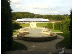
Alnwick Garden - the inspiration of the Duchess of Northumberland

Alnwick, NE66 1YU, Northumberland, England