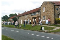
Folk Museum in the North York Moors

Hutton le Hole, YO62 6UA, North Yorkshire, England